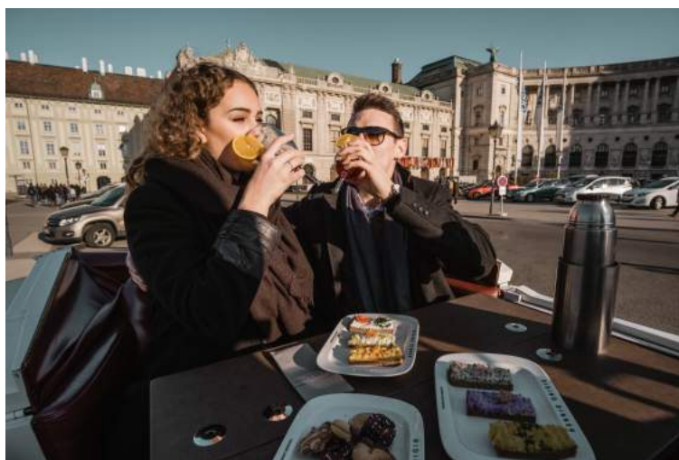
Picture: Tea Time & Coffee Break.