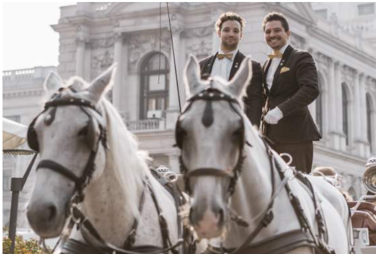
Picture: We are looking forward to be your special Vienna experience.